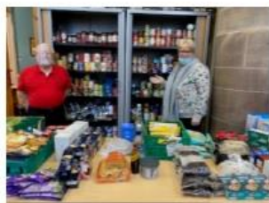
St Clement's Community Centre