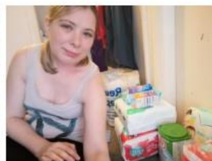
Visit from the Stork