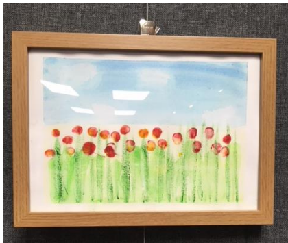
Fiddlers Lane Community Primary School have run a art and crafts holiday club for the benefit of children and parents in Irlam and Cadishead.