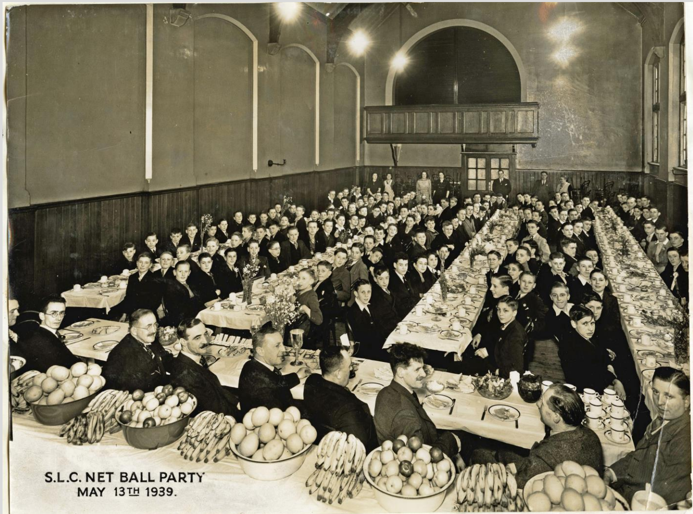
S.L.C. NET BALL PARTY MAY 13 TH 1939.